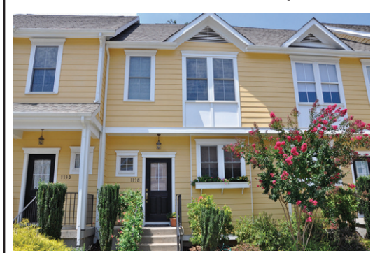
FRANK HARDY INC., REALTORS Residential Brokers